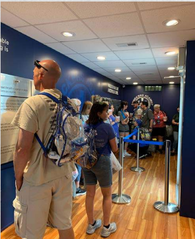
More than 550 Walmart shareholders toured the FDP at the Walmart Shareholders Celebration.

The FDP participated in 16 events this quarter, with 1,828 participants touring the trailer. A few of those included: