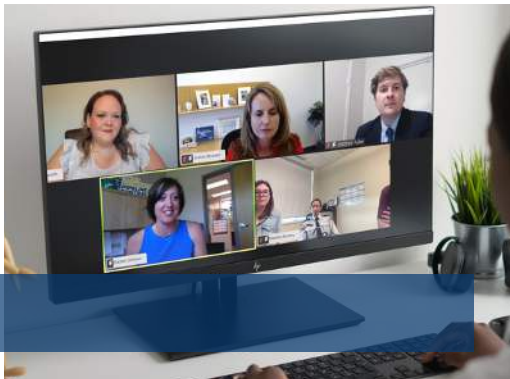
Attendees heard from a panel of private and public partners about their experiences with TAT.