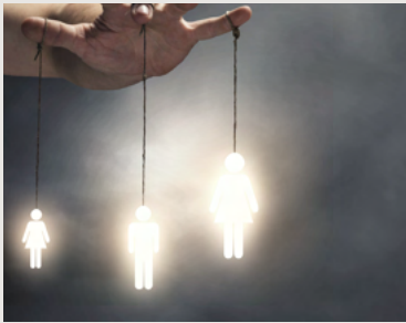
WHAT IS HUMAN TRAFFICKING?

This human trafficking awareness safety briefing is brought to us by TAT. You can play an important role in helping to combat human trafficking.