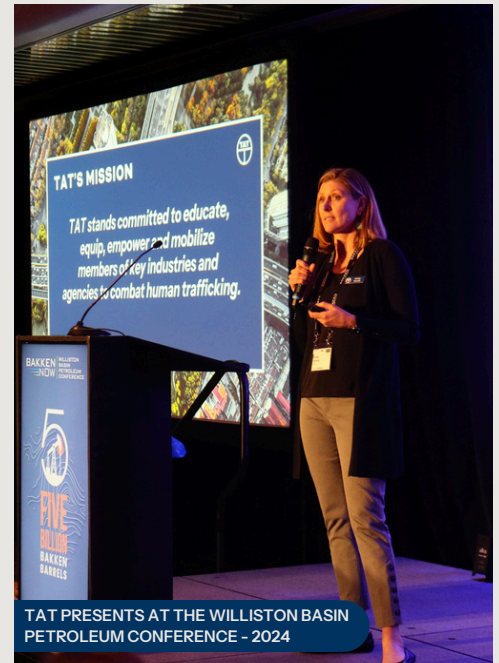
TAT PRESENTS AT THE WILLISTON BASIN PETROLEUM CONFERENCE - 2024