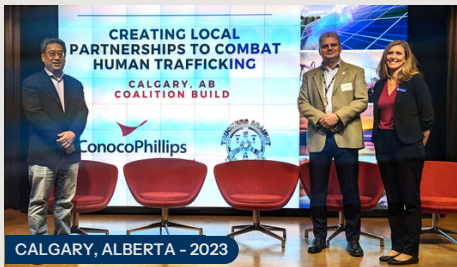
CALGARY, ALBERTA - 2023