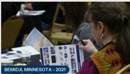
BEMIDJI, MINNESOTA - 2021

In the past five years, TAT has hosted eight, in-person, energy Coalition Builds in four U.S. states (Texas, North Dakota, New Mexico and Minnesota) and one Canadian province (Alberta), focused on bringing the energy and transportation industries in target locations together with law enforcement and government agencies to devise shared local strategies to combat human trafficking. These events have reached a combined total of 562 attendees representing energy, trucking, truck stop and security companies, law enforcement and government agencies.