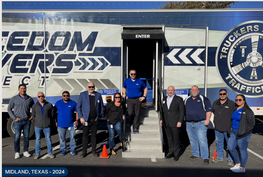
MIDLAND, TEXAS - 2024

“ I love that we’re leaving with a new-found responsibility and understanding of the role we play in preventing and intervening in human trafficking. - Survey Respondent, Midland ”