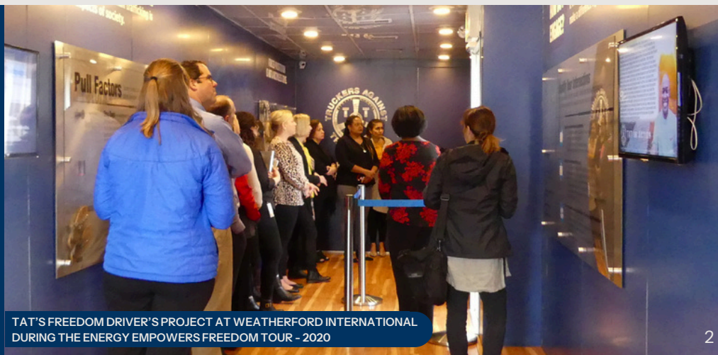
TAT'S FREEDOM DRIVER'S PROJECT AT WEATHERFORD INTERNATIONAL DURING THE ENERGY EMPOWERS FREEDOM TOUR - 2020

TAT works alongside the energy industry to spread awareness about human trafficking within their companies, communities and networks.