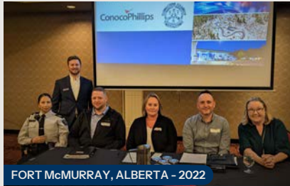
FORT McMURRAY, ALBERTA - 2022