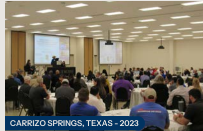
CARRIZO SPRINGS, TEXAS - 2023

“ I love that we’re leaving with a new-found responsibility and understanding of the role we play in preventing and intervening in human trafficking. - Survey Respondent, Midland ”