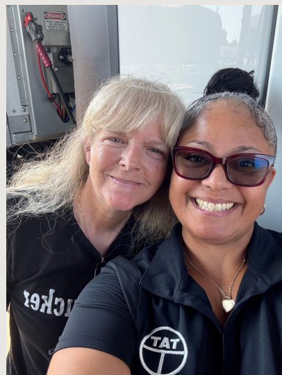
Photos from NTDaw truck stop outreach at our four partners' sites (top left: Love's; top middle: TA; top right: Pilot Flying J; bottom left: Sapp Bros.; bottom middle: TA; bottom right: Pilot Flying J)