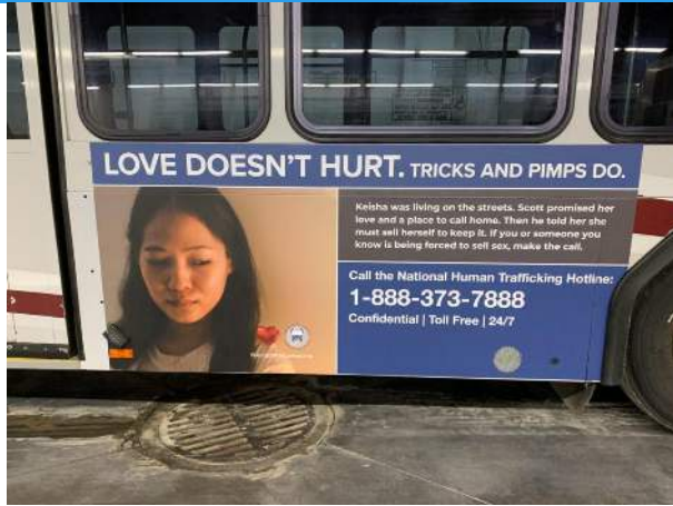
One of four Peoria CityLink buses wrapped with BOTL designs

During National Human Trafficking Awareness Month in January, Peoria CityLink, the public transit system for greater Peoria, Illinois, partnered with Busing on the Lookout (BOTL) to launch an awareness campaign using our victim-centered posters. The campaign included wrapping the exterior of four buses with BOTL's designs for the month, as well as hanging interior posters on all 51 buses in their fleet, which will stay posted year-round. Peoria CityLink has been training all new drivers with BOTL materials since 2020 and plans to train all 140 existing employees during their company-wide safety meetings this month.