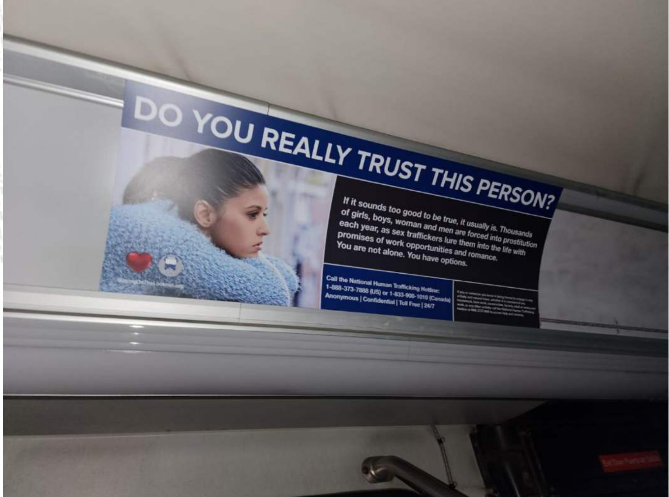
An interior BOTL victim-centered poster in a Peoria CityLink bus